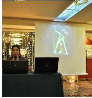
Recent photos from participation in conferences, workshops, presentations of ancient drama ...